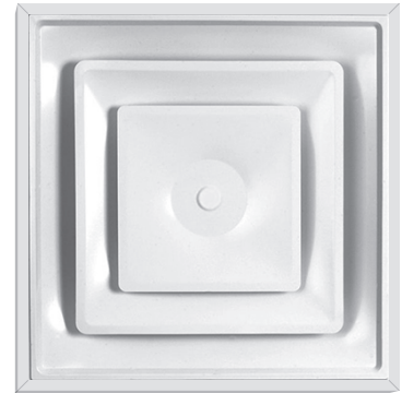
NT (DF3-NT shown here)