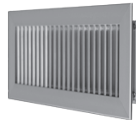
REAL Residential Floor Grille